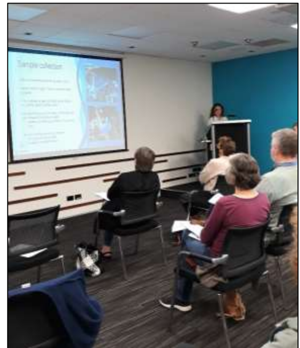
chart here is for the Waiwhetu stream. Amy's presentation is also on the FoWS website.

You can go to the Wilderlab website and search the results – the code for the Waiwhetu Stream is 602017. The