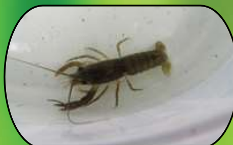
Koura, picked up (and released) in the October bug survey

If you see anything odd in the stream report it to the Hutt City Council on their website. The Council will take action against polluters.